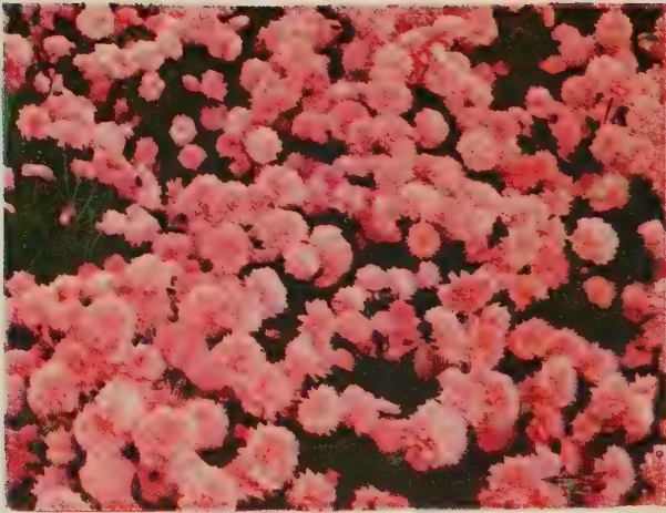
CHORALE. 60c each; 3 for $1.50